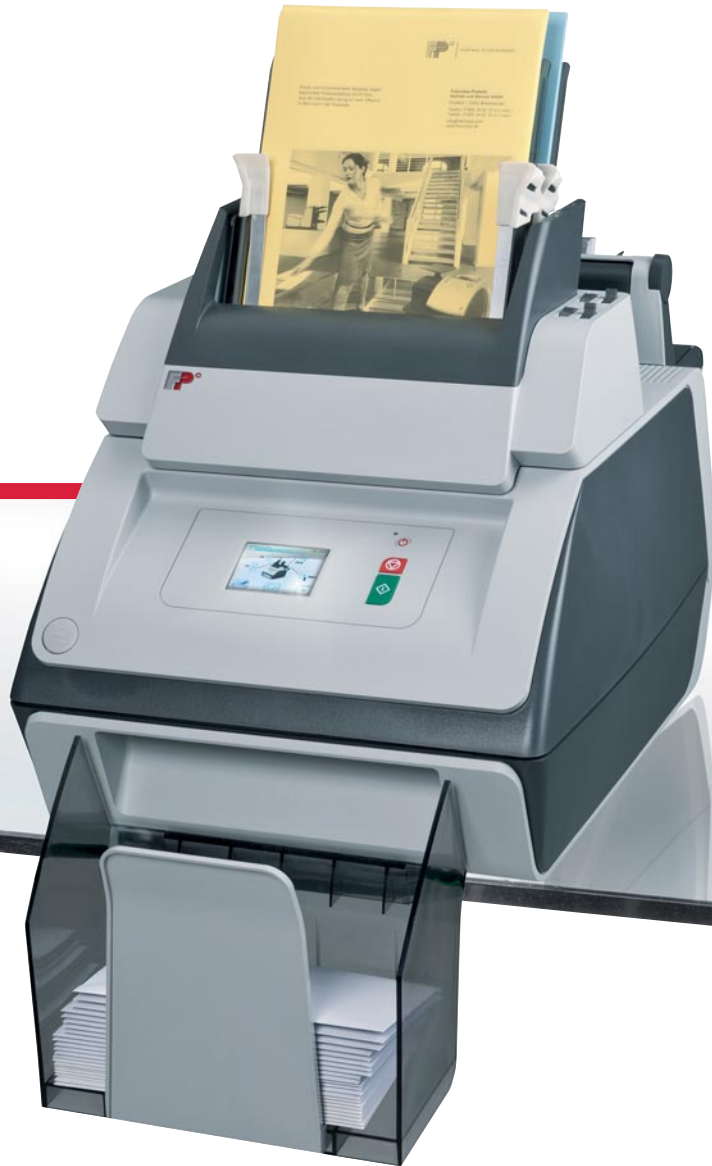
Table-top Inserting System FPI 600